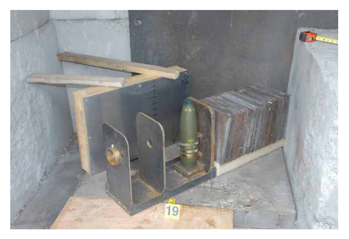
Figure 2: Set-up of the shaped charge jet tests