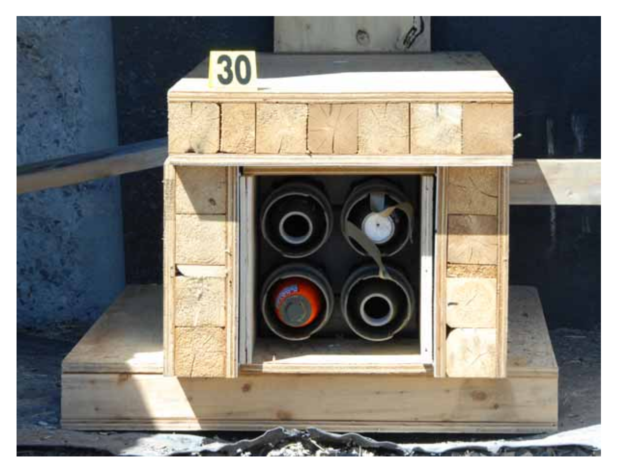
Figure 3: Set-up of the sympathetic reaction tests

selected as 25 °C/h, instead of the standard 3.3 °C/h. This was judged more realistic in a threat hazard assessment for the typical storage conditions. The oven was heated to 100 °C in 15 minutes, and then left at 100 °C for 105 minutes to stabilize. The oven was then heated at 25 °C/hr until a reaction occurred. Four thermocouples were placed on the set-up: the control thermocouple was in the oven at mid-height. There was also one at the top of the oven, one in the propellant, and one on the brass cartridge. This latter temperature was reported as the reaction temperature. A reaction was generally observed within 5-6 hours from the beginning of the tests, which is ideal for preliminary tests. The igniter and the igniter tube were removed for these tests, making them evaluate solely the reaction of the propellant.